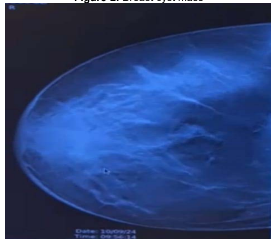
Fig-3: mammogram showing a dense, possibly abnormal area within the breast tissue.